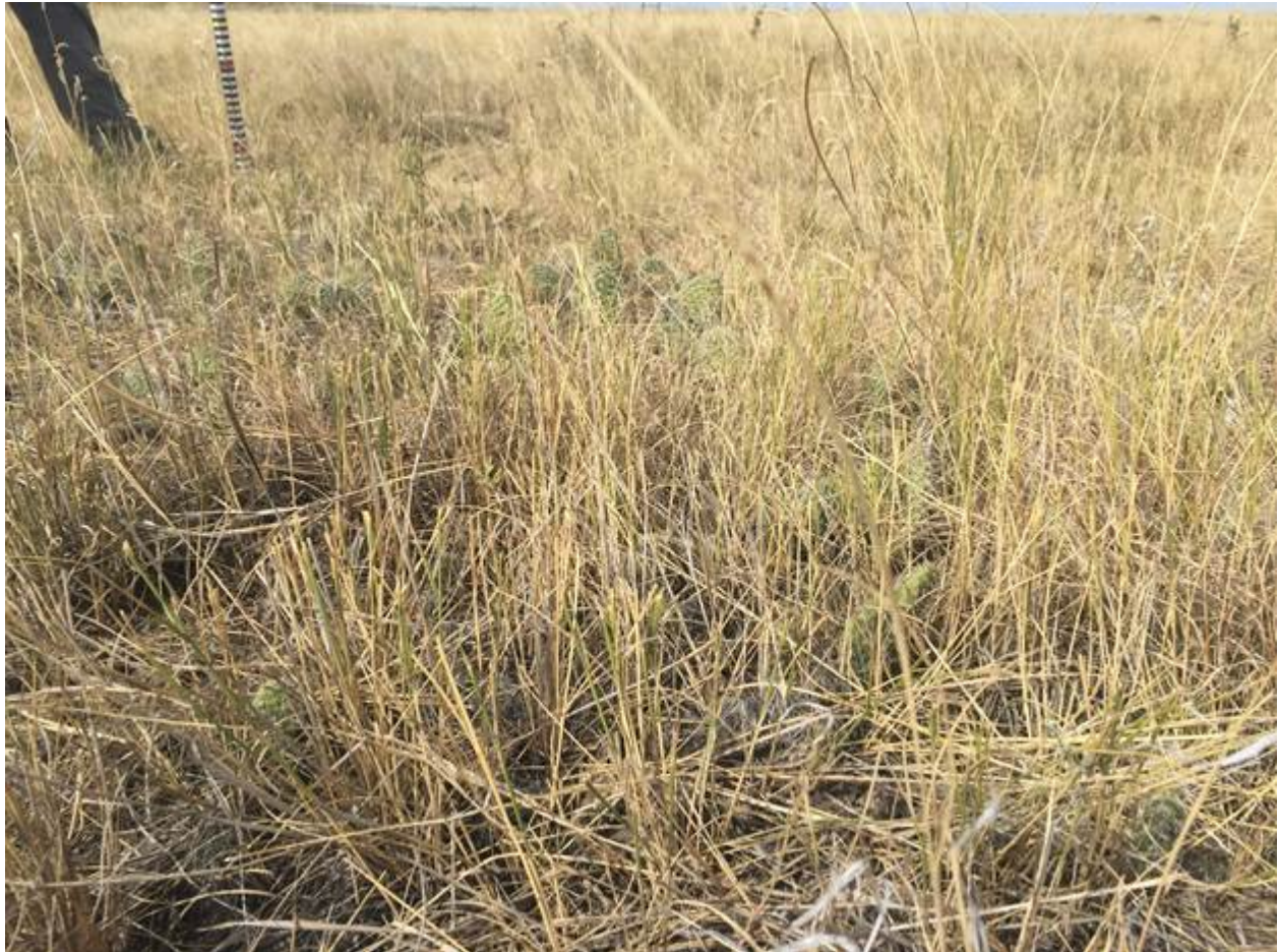
Above: Evidence of grazing on mature western wheatgrass stands.